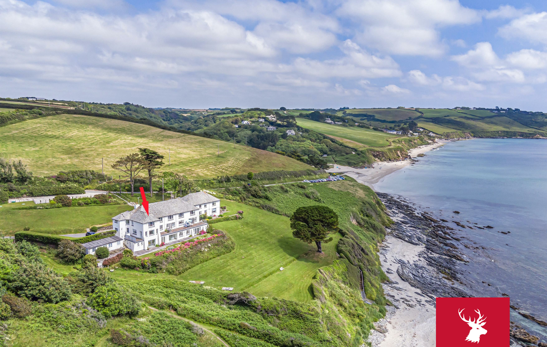
1, Pendower Court